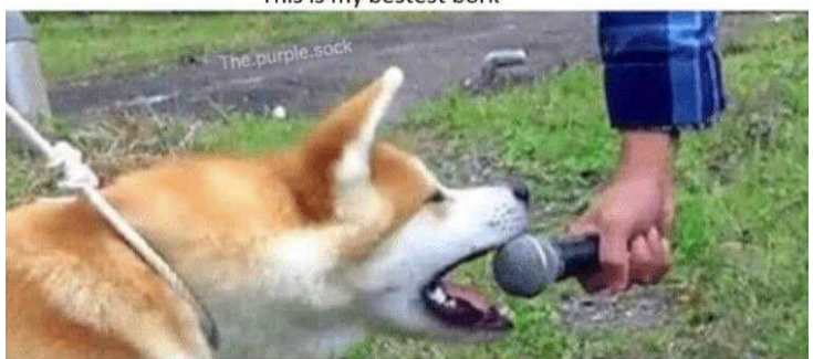
Domestication No breeding Can't give a heck Cause they neutered my weenie