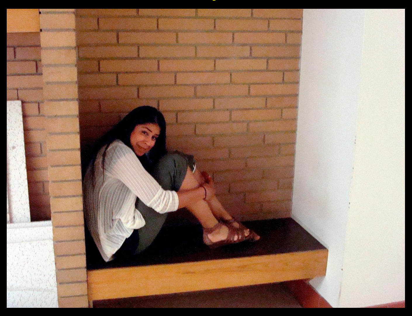
This picture explains it all. Leaves you speechless doesn't it?